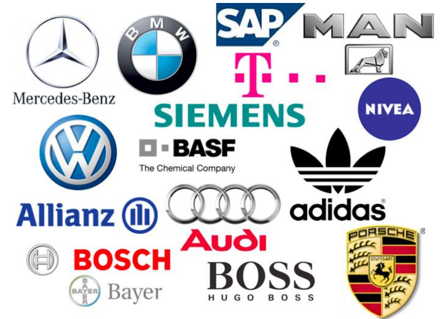
German economy is the largest in the EU GDP in 2012, Euro (billions)

This exchange will give students the opportunity to immerse themselves in a global economy and develop essential skills for their future careers.